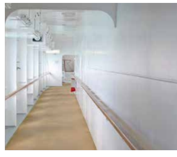
Corridors and passageways