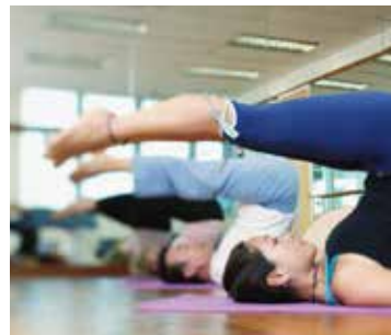
Sports and fitness rooms