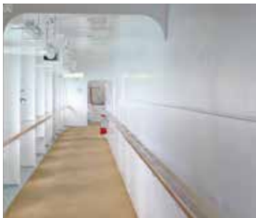
Corridors and passageways