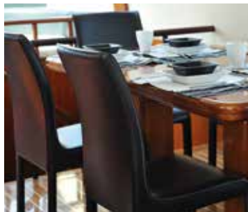
Catering and dining areas